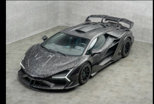
Mansory : A luxury tuning firm based in Germany, famous for its extreme modifications to brands such as Rolls-Royce, Lamborghini and Ferrari.