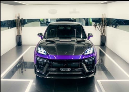
Techart : A German company specialising in the customisation and performance enhancement of Porsche vehicles, combining elegance and power.