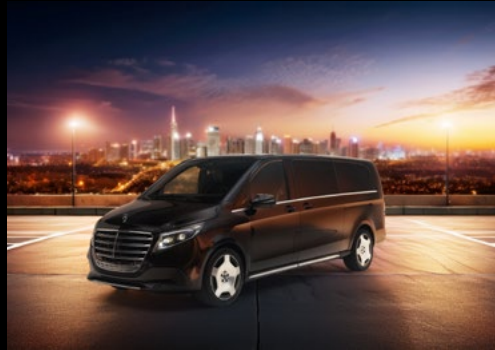
Cavalier : A car customisation brand focused on unique aesthetic modifications, often inspired by luxury and bespoke design.