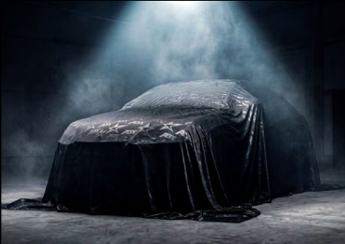
ABT : A German tuning firm specialising in optimising Audis, renowned for its performance gains and sporty styling, and represented by Stars Mc