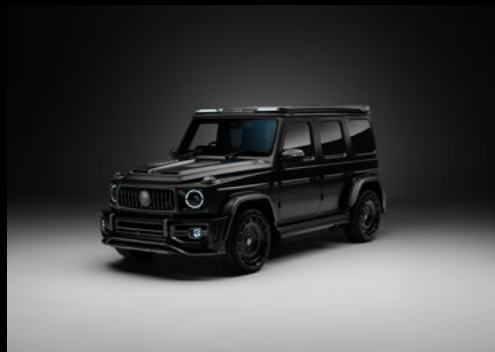
Urban Automotive : A British brand renowned for its modern and aggressive body kits, primarily for Range Rovers.