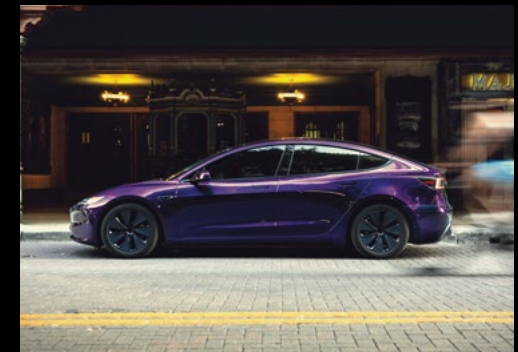
XPEL : EA company specialising in paint protection films (PPF) and tinted windows, protecting vehicles against scratches and impacts, represented by Pit Stop Monaco