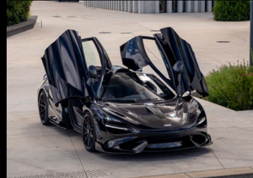
Elite Wrap : Elite Wrap is a specialist in automotive customisation, offering wrapping services, exhaust fitting and bespoke wheel installation to transform the appearance and performance of every vehicle.