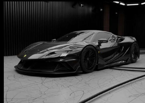
Vennum : A specialist workshop based in Dubai.